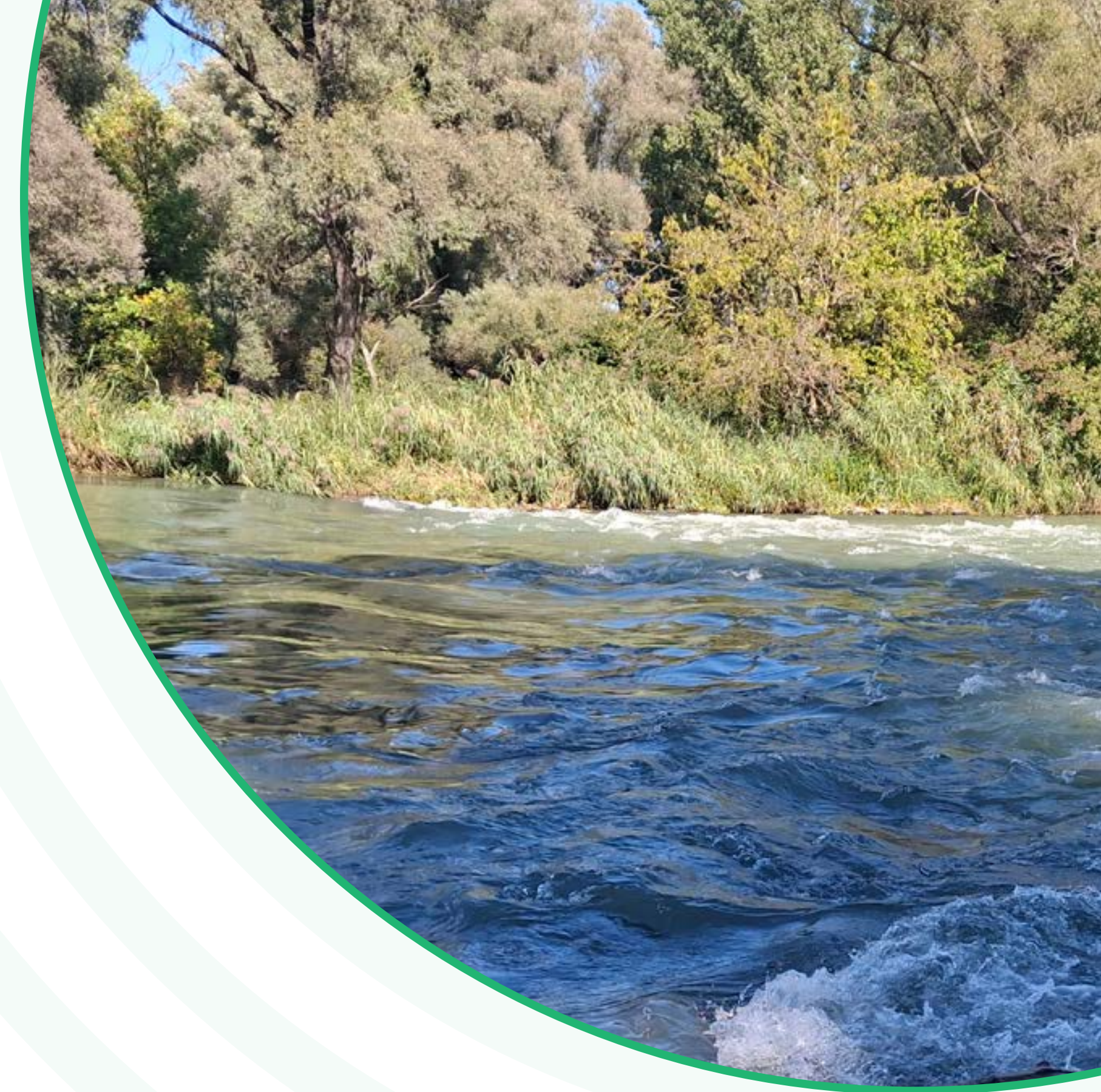
Dunaremete Slalom Course

The sprint course will be located on the slalom course. The start will be above on the flatwater, have to cross under the bridge and go through 120 m long and 56 m wide slalom course with 1,5 m drop about 100 m 3 /sec. The sprint will be 245 m long WWI-II. Entry to the water is possible on the left side of the river in a small harbor above the start. Exit from the course is possible either river right on the ramp or river left on stairs. On trainings it is possible to use the stairs and the small harbor around the bridge for entry to the river and paddle up to the start.